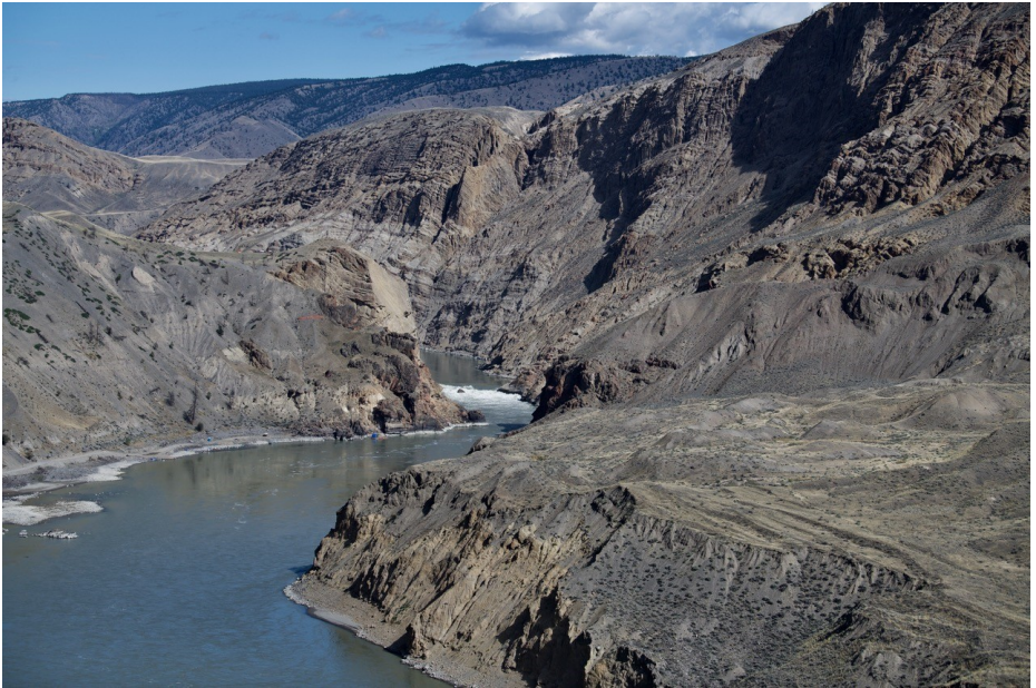
Chinook, Sockeye, Pink and Coho salmon continue to achieve natural passage through the Big Bar Landslide.