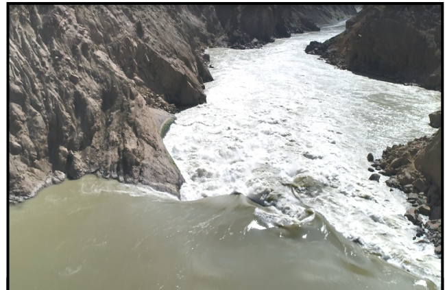
The five metre (16 foot) waterfall that resulted from the landslide.