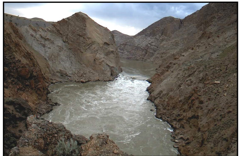
An aerial view of the landslide from downriver.